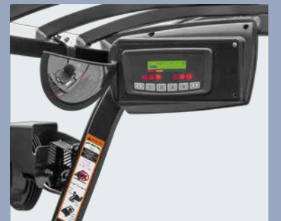
Easy to see display