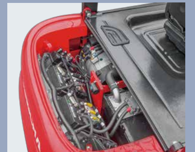
Easy for maintenance