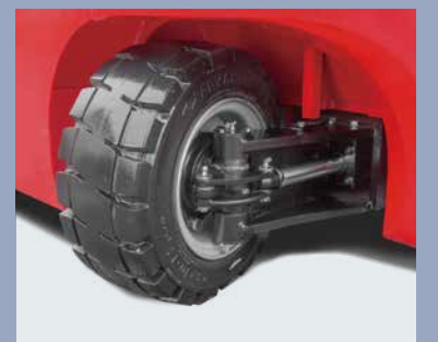
Smaller turning radius