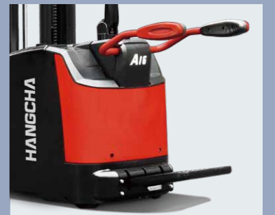
The integrated stamping molded guardrail offers better protection for the operator