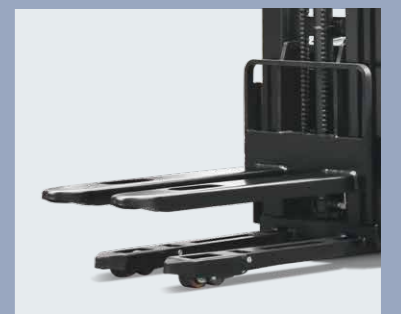
Tandem load wheel