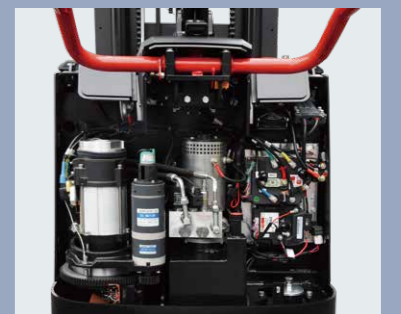
Back cover can be opened fully, and all components and parts are clear at a glance, which is very convenient for maintenance of the entire machine