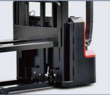
Side battery change is standard specification