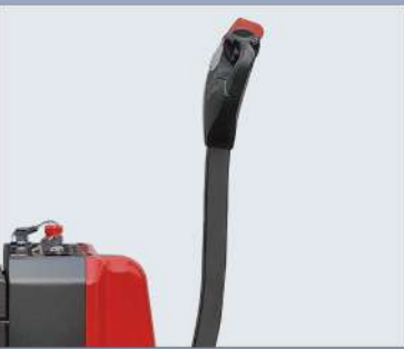
Mast tilting is the optional feature, offers proportional forward/backward speed