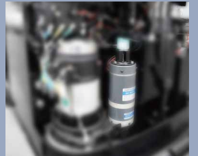
EPS (Electric Power Steering) is standard specification