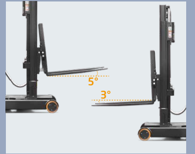
Fork tilt F/R: 3° / 5°