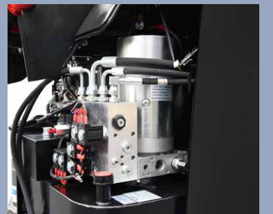
BUCHER hydraulic unit