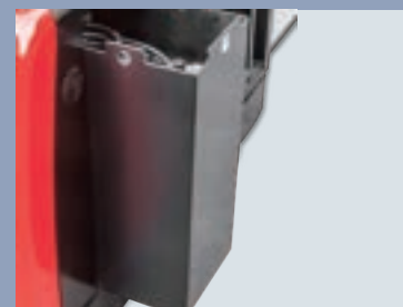
Battery side roll out