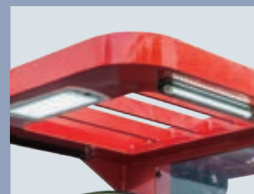
LED top lamp can provide bright operating environment