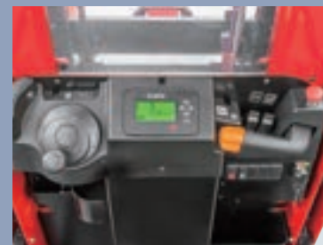
The FREE accelerator lever with sensor switch, as standard configuration, can prevent mis-operation during the work