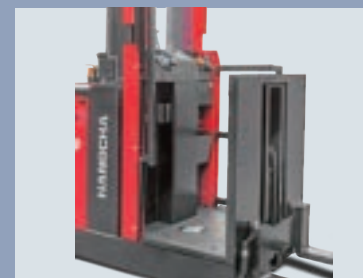
Order picker works only when the side barriers are all lowered