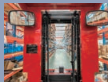
Better vision for operation