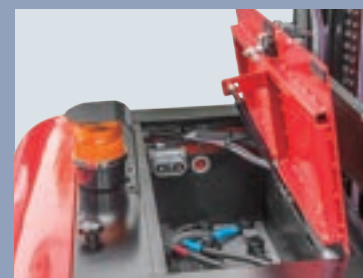
The rear hood can be removed easily to facilitate maintenance work on parts such as hydraulic unit, electronic control system and the motor