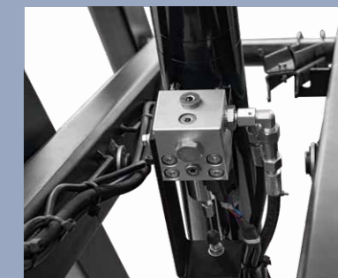
Explosion proof valve, To prevent the machine falling when the oil pipe is leaking