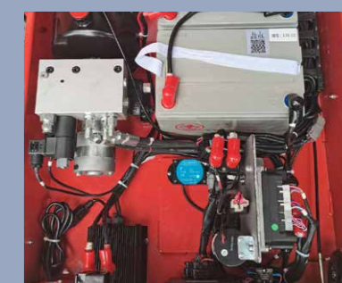
The parts are well located