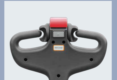
The upright-tiller running function allows it to work within confined space, such as container