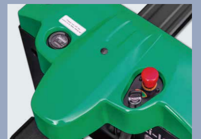
Body feature smooth lines and affluent sense of movement, and compact profile, in accord with the latest appearance design trend