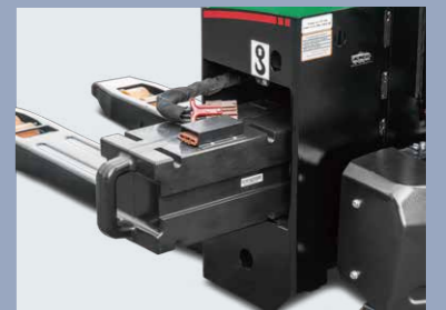
Easy for exchanging battery