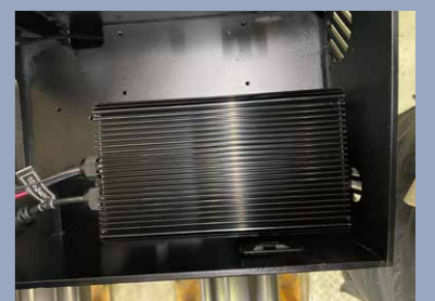
Built-in charger, charging is more convenient