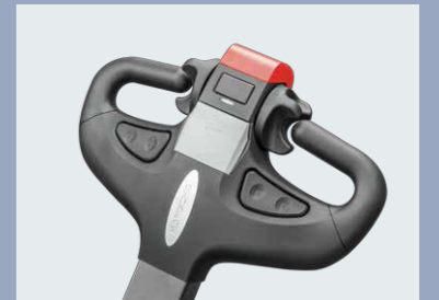
The modular tiller is simple but reliable and beautiful, all parts inside it can be replaced separately and all operations can be done easily with one hand