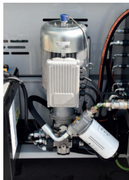
AC electric power unit