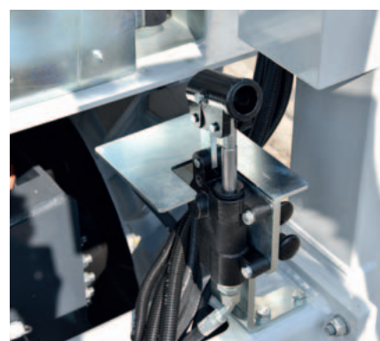
Stabilizers manual descent device