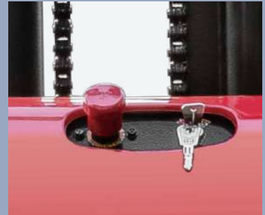
The non-contact proximity switch has a long life and can work reliably