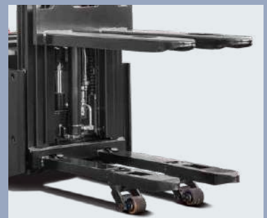
With the upper and lower pallet handling design to meet the stacking operation need and enable a higher efficiency of goods handling