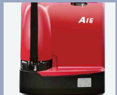
Designed to be narrow with large round corners to improve suitability for concentrated shelves and with a wedge-shape chassis to provide higher passing ability