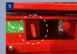
Manual lowering valve: When the operation system failed or the battery power is too low to let the platform decline, we can use this valve to lower the machine