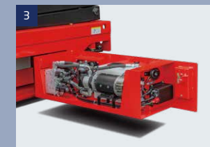
Hydraulic and electric system