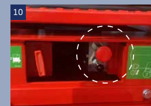
Manual release valve: When the machine can not move, you can push the machine after pressing this valve