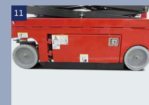
Anti-overturning system: When the machine raises to more than 6.5ft, this system will work automatically, to protect the machine from overturning while walking at un-leveling ground.