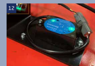
Angle sensor: when it is lifting and walking on the slope, the sensor will automatically judge the status of the machine, if the angle is larger than the rated angle, it will alarm to remind the operator.