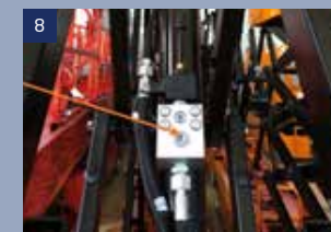
Explosion proof valve: To prevent the machine falling when the oil pipe is leaking