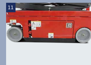
Anti-overturning system: When the machine raises to more than 6.5ft, this system will work automatically, to protect the machine from overturning while walking at un-leveling ground.