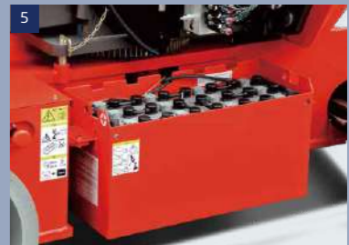
5 Standard tracking battery: Reduce 40% of the charge time, raise 50% of the life time