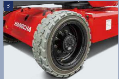
3 Tires: foam-filled tires with good off-road performance