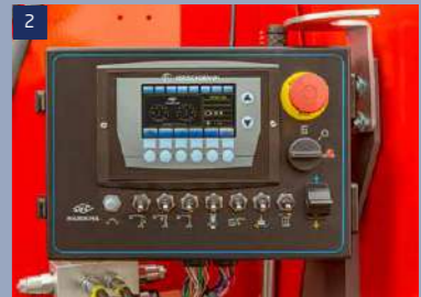
2 Base control box: the control box can be used to control each action of the device, easy to understand