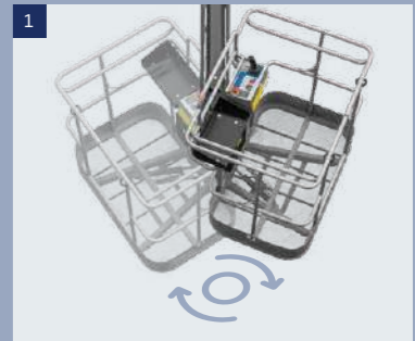
1 Basket: can be rotated left and right at an Angle of 140°