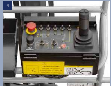
4 Basket control box: each action of the device can be controlled through the control box to quickly reach the working area, and the control is simple and easy to understand